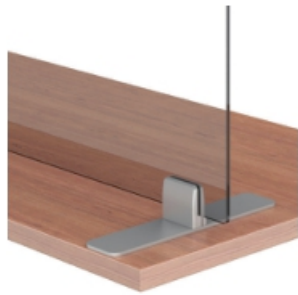
Freestanding Clip Screen Only in Lexan (The foot is 12" total in length.)