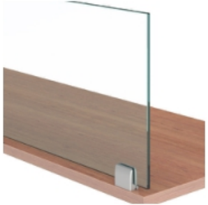
Glass 1/4" or 3/8" Clear