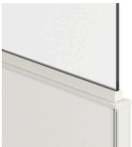
Surface Mount Channel Screen on Panel Shown on Divi Linear.*

*Offered on Linear and Radius trim. For more information, please contact Screen Team (see contact info below).