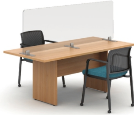
Freestanding Clip Screen. (Only in Lexan.)