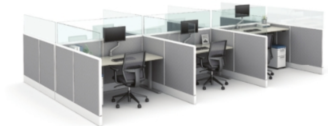
Channel Screen Surface Mount on Panel.