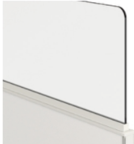
Lexan™ 1/4" or 3/8" Lexan Polycarbonate Clear

Note: We do not recommend blending Glass screens and Lexan screens as they will appear different.