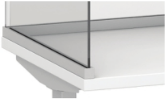
Channel Supported Surface Mount