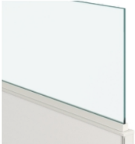
Glass 1/4" or 3/8" Clear