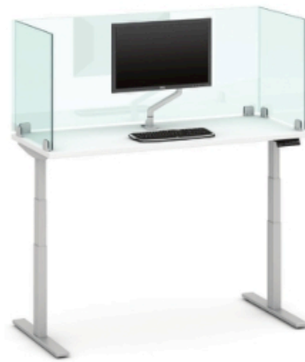
Clip Screen, Surface Mount with Glass.