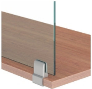
Under Surface Mount Clip Screen