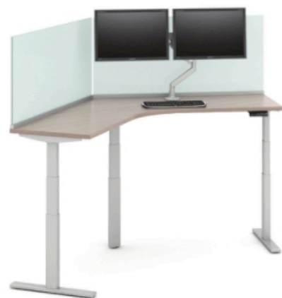
Channel Screen with Surface Mount in Glass on 120° Height Adjustable Table.

Contact Wakefield Moving & Storage for questions: (800) 225-3688.