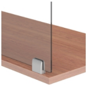
Surface Mount Clip Screen