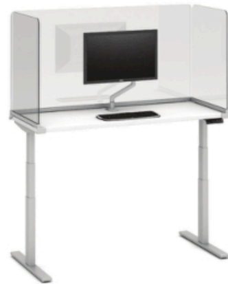
Channel Screen with Under Surface Mount in Lexan on Height Adjustable Table.