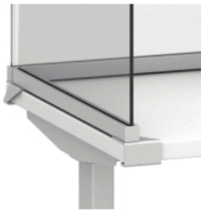
Under Surface Mount Channel Screen