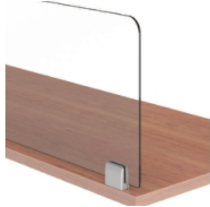
Lexan™ 1/4" or 3/8" Lexan Polycarbonate Clear

Note: We do not recommend blending Glass screens and Lexan screens as they will appear different.