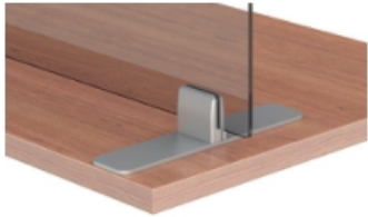
Clip Screen Freestanding (Non-Marring)