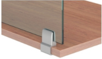
Clip Supported Under Surface Mount (Non-Marring)