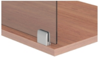
Clip Supported Surface Mount