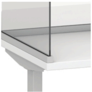
Surface Mount Channel Screen